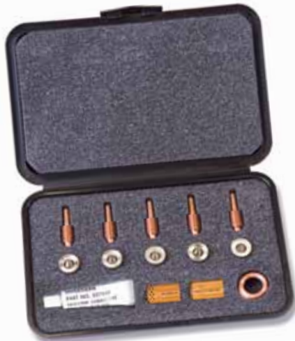
Shown: Powermax1000/1250/1650 FineCut kit

† RT80 and RT80M retrofit torches are designed for Powermax1100