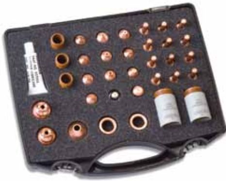
Shown: Powermax1650 All-in-one kit